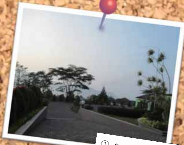
① Sarongge Valley