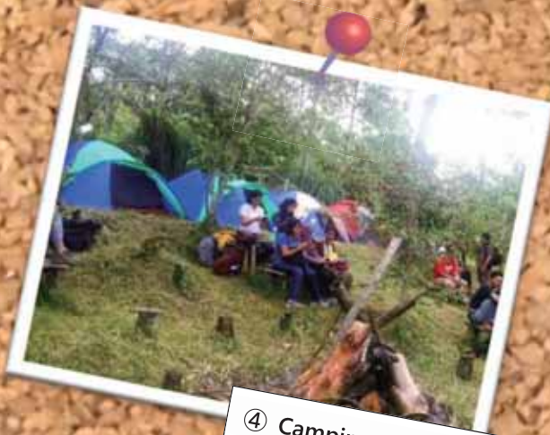
④ Camping Ground