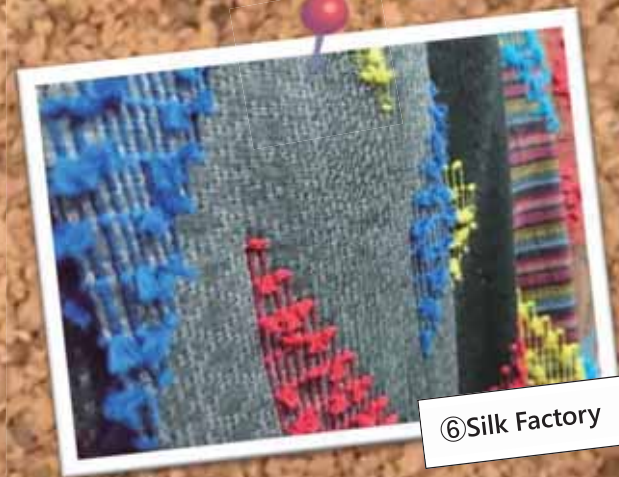
⑥ Silk Factory