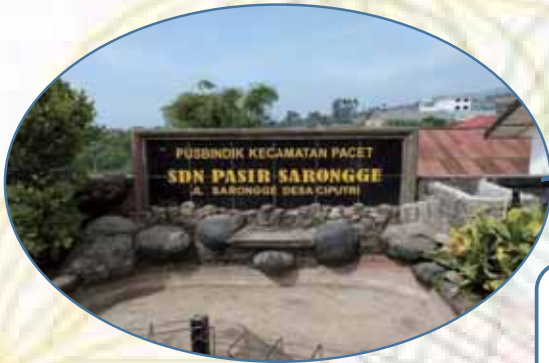
SDN Pasir Sarongge (Pasir Sarongge Elementary school)