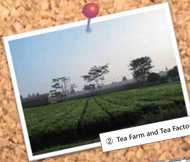
② Tea Farm and Tea Factory