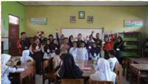
There are over 1,000 students. They had great performances!