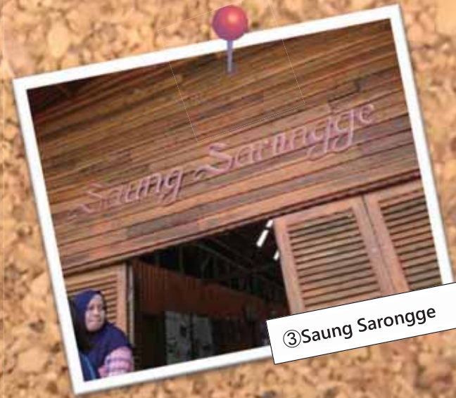
③ Saung Sarongge